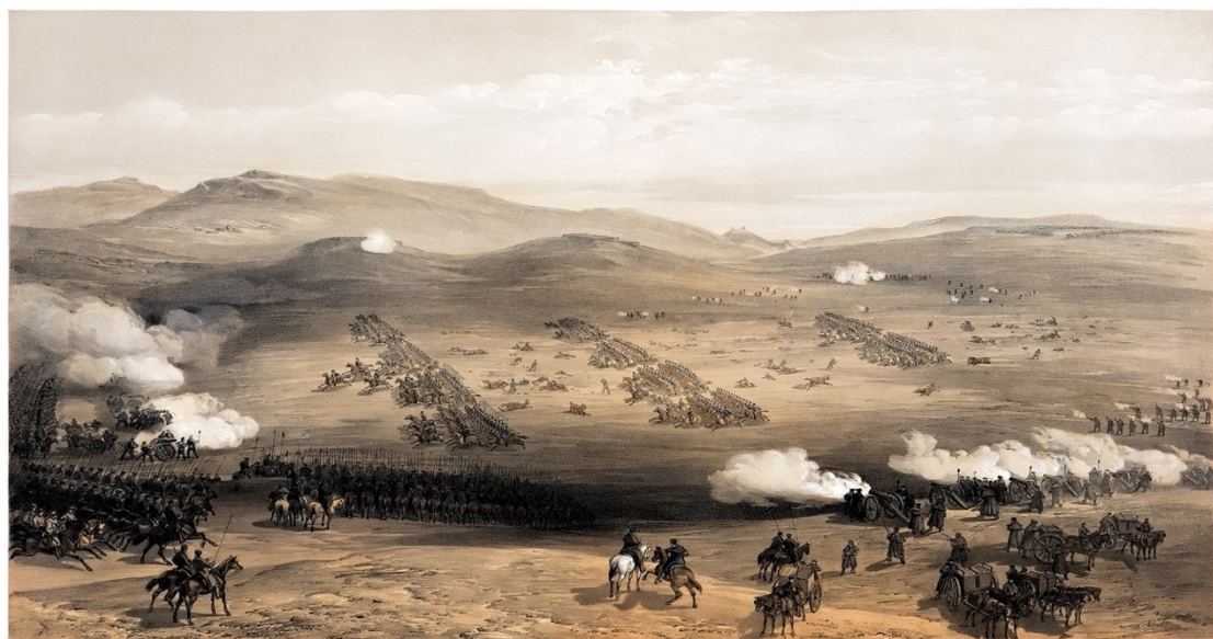
CHARGE OF THE LIGHT CAVALRY BRIGADE. 25TH OCT. 1854. THIRD MAJOR GENERAL THE EARL OF CARDIGAN.

The Charge of the Light Brigade was a failed military action involving the British light cavalry led by Lord Cardigan against Russian forces during the Battle of Balaclava on 25 October 1854 in the Crimean War.